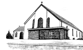
St. Brigid's Church,