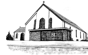
St. Brigid's Church,