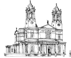
Ss. Peter & Paul's Church, Athlone