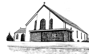
St. Brigid's Church,