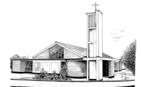
Church of Our Lady of the