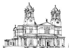
Ss. Peter & Paul's Church, Athlone

Baptism, Confirmation & Marriage Certificates are issued from the Sacristy