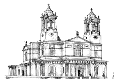
Ss. Peter & Paul's Church, Athlone