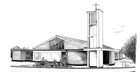
Church of Our Lady of the Wayside, Clonown