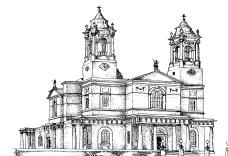
Ss. Peter & Paul's Church, Athlone

Thank you for your on-going support and generosity