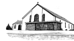
St. Brigid's Church, Drum