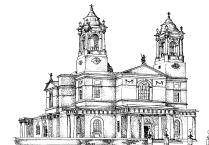
Ss. Peter & Paul's Church, Athlone

Baptism, Confirmation & Marriage Certificates are issued from the Sacristy