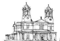
Ss. Peter & Paul's Church, Athlone

Baptism, Confirmation & Marriage Certificates are issued from the Sacristy