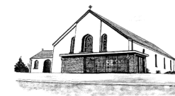
St. Brigid's Church, Drum