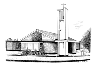
Church of Our Lady of the Wayside, Clonown