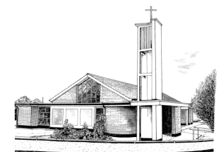
Church of Our Lady of the Wayside, Clonown