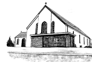
St. Brigid's Church, Drum