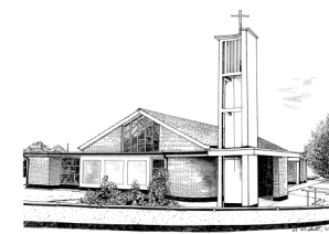
Church of Our Lady of the Wayside, Clonown