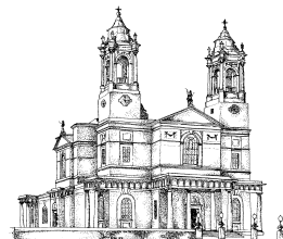
Ss. Peter & Paul's Church, Athlone

Excerpt from the Lectionary for Mass (2001, 1998, 1970 CCD)