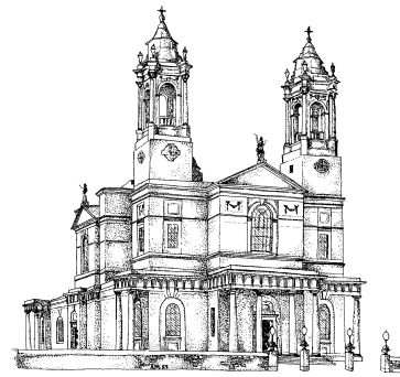
Ss. Peter & Paul's Church, Athlone E-mail sspeterparish@eir.net

OFFERTORY COLLECTION: Sunday, 10th April ..... €2,090