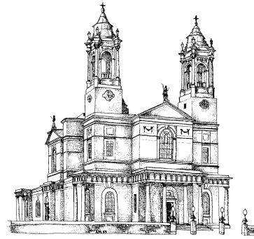
Ss. Peter & Paul's Church, Athlone E-mail sspeterparish@eir.net

OFFERTORY COLLECTION: Sunday, 7th February.....€1,937.00