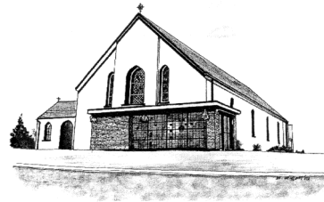
St. Brigid's Church, Drum E-mail drumparish1@gmail.com www.drum.ie