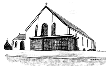
St. Brigid's Church, Drum E-mail drumparish1@gmail.com www.drum.ie