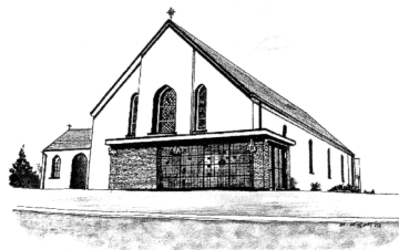
St. Brigid's Church, Drum E-mail drumparish1@gmail.com www.drum.ie