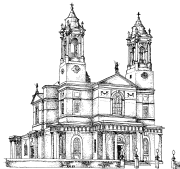
Ss. Peter & Paul's Church, Athlone E-mail sspeterparish@eir.net

OFFERTORY COLLECTION: Sunday, 25th October..... € 1,930 MAINTENANCE COLLECTION: ..... € 670